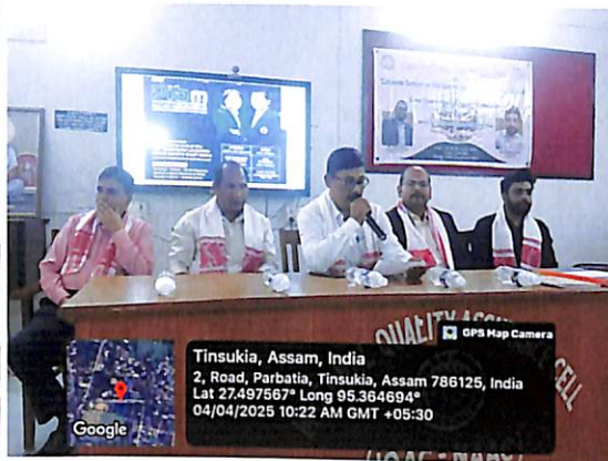
Tinsukia, Assam, India 2, Road, Parbatia, Tinsukia, Assam 786125, India Lat 27.497567° Long 95.364694° 04/04/2025 10:22 AM GMT +05:30