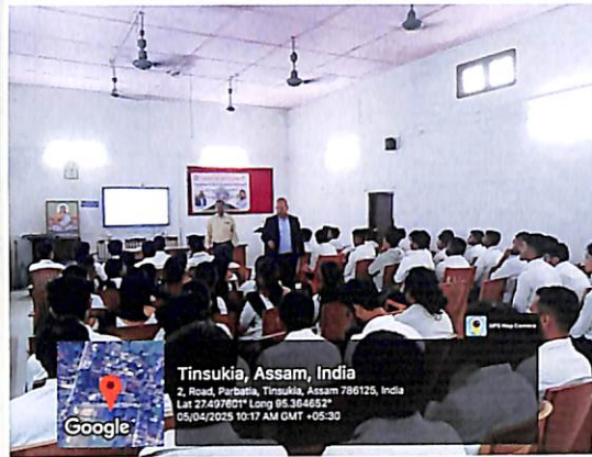
Tinsukia, Assam, India 2, Road, Parbatia, Tinsukia, Assam 786125, India Lat 27.497801° Long 95.364657° 05/04/2025 10:17 AM GMT +05:30