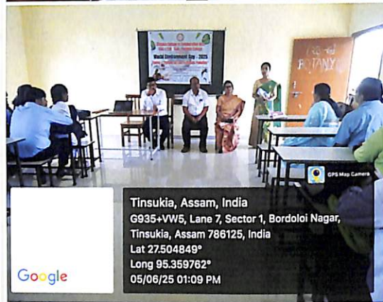
Tinsukia, Assam, India G935+VW5, Lane 7, Sector 1, Bordoloi Nagar, Tinsukia, Assam 786125, India Lat 27.504849° Long 95.359762° 05/06/25 01:09 PM