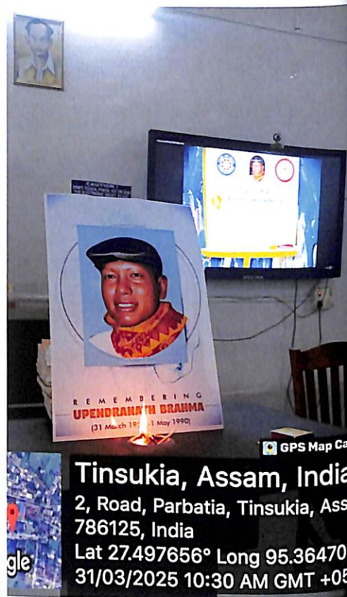
Tinsukia, Assam, India 2, Road, Parbatia, Tinsukia, Assam 786125, India Lat 27.497656° Long 95.36470° 31/03/2025 10:30 AM GMT +05:30