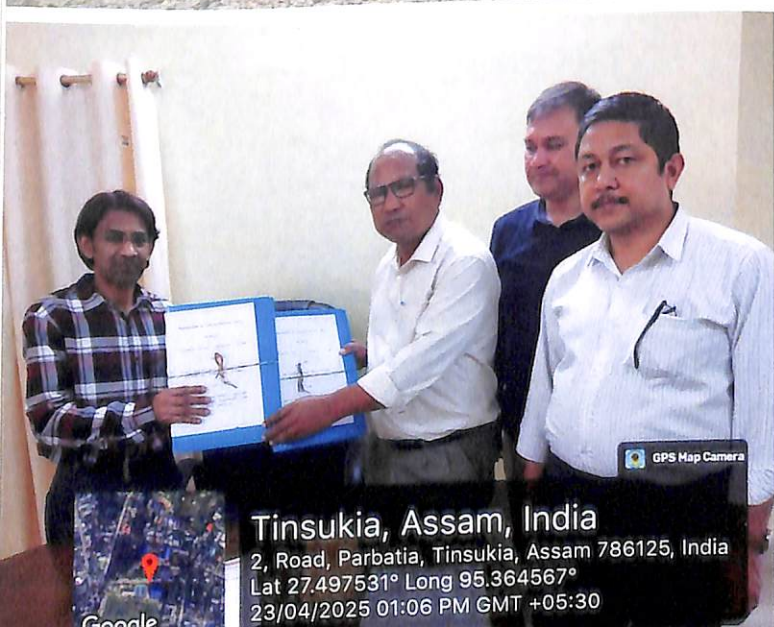
Tinsukia, Assam, India 2, Road, Parbatia, Tinsukia, Assam 786125, India Lat 27.497531° Long 95.364567° 23/04/2025 01:06 PM GMT +05:30