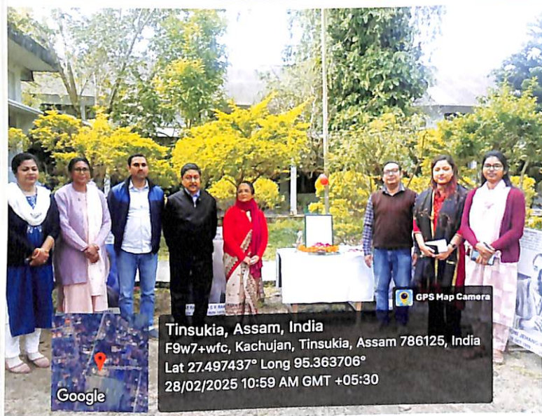
Tinsukia, Assam, India F9w7+wfc, Kachujan, Tinsukia, Assam 786125, India Lat 27.497437° Long 95.363706° 28/02/2025 10:59 AM GMT +05:30